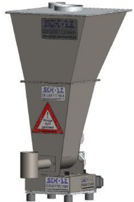
LOGO with 68-Liter-Hopper and vertical tube-outlet placed on platform-scale BASIC300