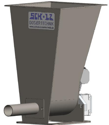
LOGO with horizontal Tube-Outlet

The SCHOLZ-CON-TRUST control system enables single- and multi-component operation.