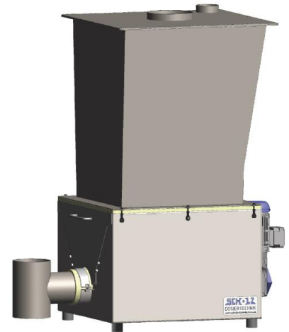
FLEX130 with 300-Liter-hopper and vertical tube-outlet

The SCHOLZ-CON-TRUST control system enables single- and multi-component operation.