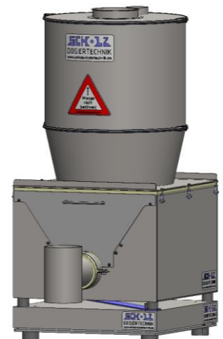
FLEX130 with 65+150-Liter-hoppers and vertical tube-outlet placed on Platform scale BASIC700